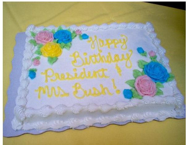
Birthday Cake of Former President Bush